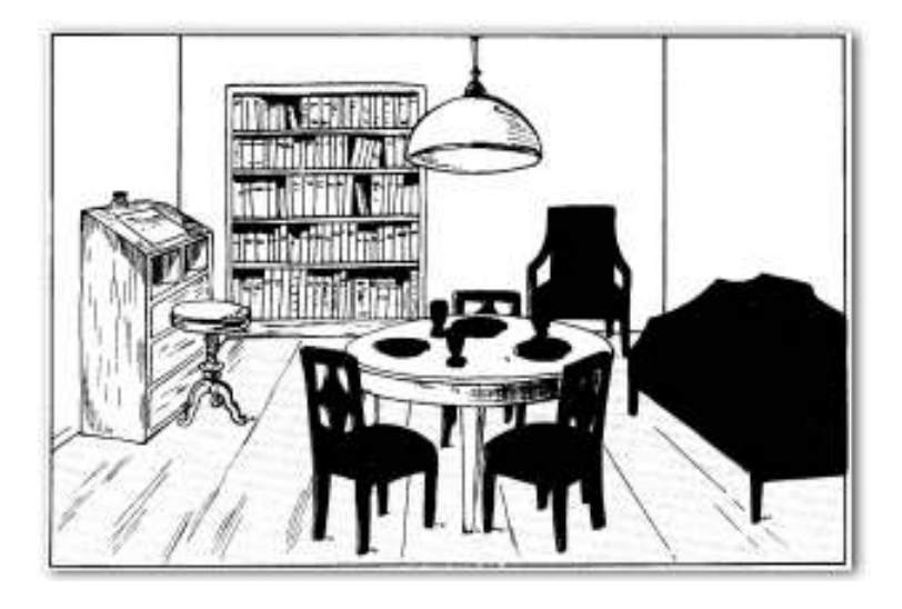
Fig. 2 - The room in terms of functional tones connected with its object by man<sup>1</sup>

"All the characteristics of the objects are in fact nothing other than the perceptive characters that are attributed to them by the subject with whom they have a relationship" (von Uexküll, quoted in Berthoz, 2008). The umwelt is, therefore, a dynamic, interactive concept that defines the relations between the physical world and living organisms, and constitutes the basis and the assumption of intersubjectivity(A. Berthoz, 2009), an interface in which "the significance is conferred by the Act of the subject (von Uexküll & Müller, 2004).