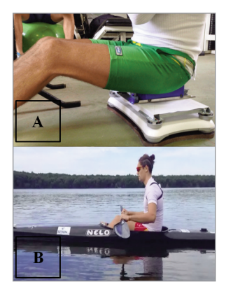
Figure 1 A, B. Wii Balance Board on the ground and in kayak.